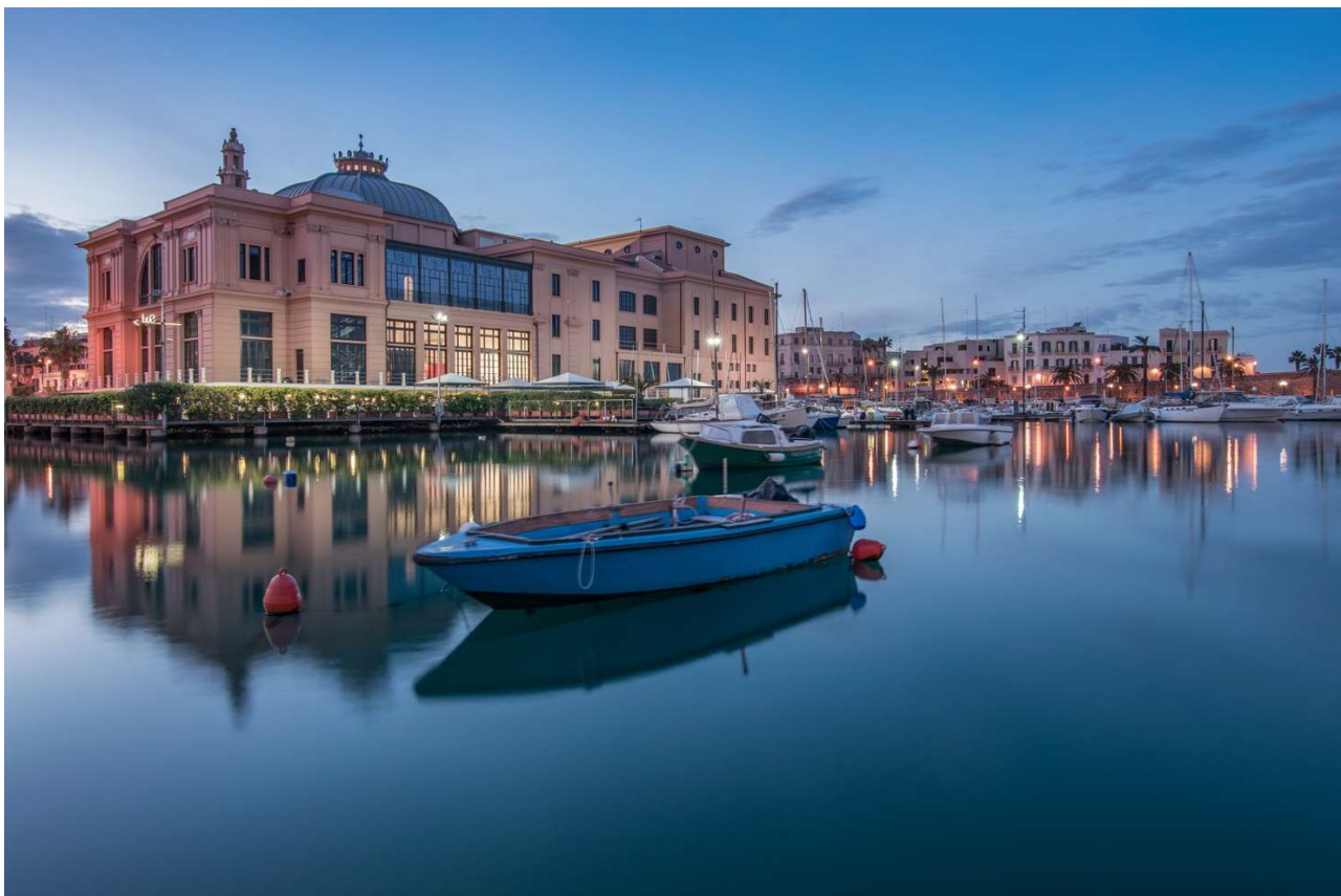
Bari, Margherita theater, the blue hour from the sea

We actively monitor the COVID-19 situation to determine if the in-person ISMAR experiences will be safe and possible given International travel rules. In the event that we must host ISMAR in a complete virtual/online format, we will notify the community by the end of July.